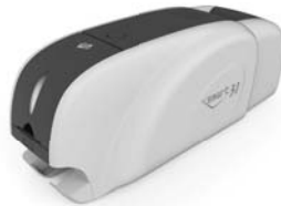
Dual sided ID CARD PRINTER smart-31 D