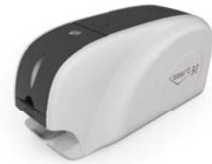
Rewritable ID CARD PRINTER smart-31 R